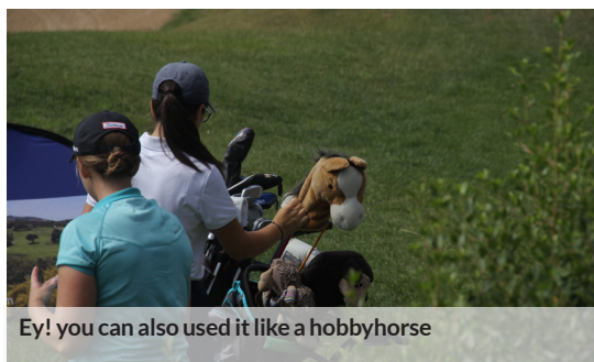
Ey! you can also used it like a hobbyhorse