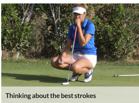
Thinking about the best strokes