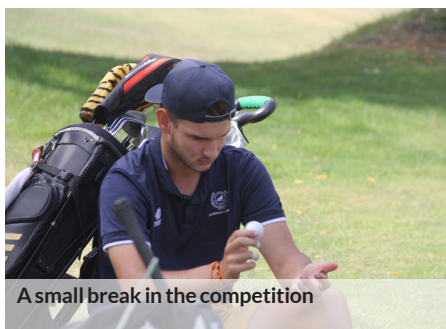
A small break in the competition

Photographs and special moments of the EUSA Golf 2019