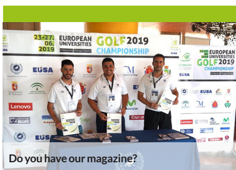
Do you have our magazine?