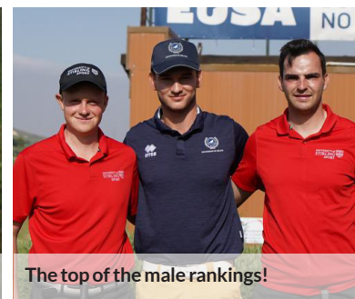
The top of the male rankings!